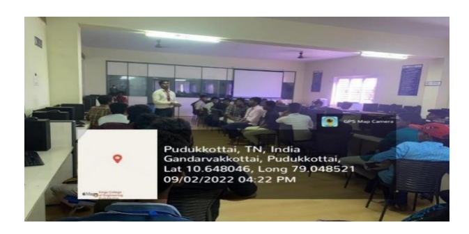
Discussion of Resource Person with participants