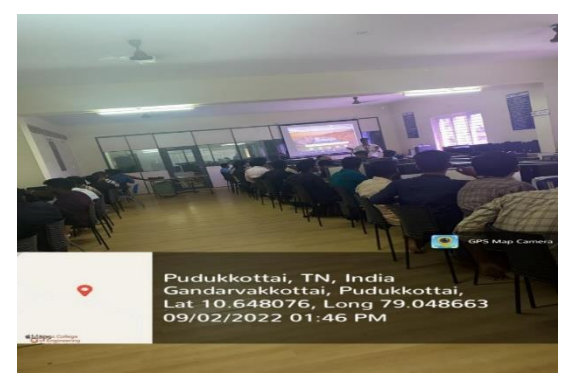
Explanation part in session